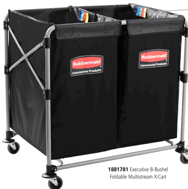
1881781 Executive 8-Bushel Foldable Multistream X-Cart

Generous top-shelf capacity, ergonomic handles, and wraparound end panels are ideal for front- and back-of-house use (FG9T6800BLA).