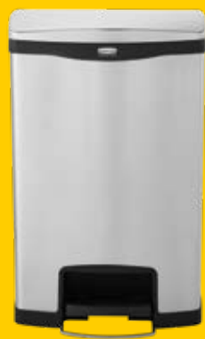
1901992 FRONT STEP