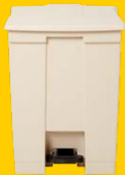
FG614500BEIG 18 GAL