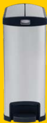
1901993 END STEP