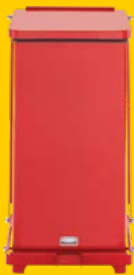
FGST12EPLRD 6.5 GAL