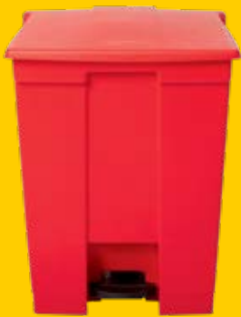
FG614500RED 18 GAL