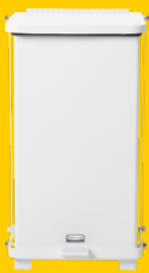
FGST12EPLWH 6.5 GAL