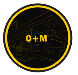
Building Operations and Maintenance

Each rating system is made up of a combination of credits. Rubbermaid Commercial Products apply to four credit categories: