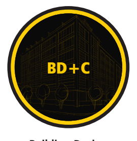
Building Design and Constructions

LEED encompasses five different facility types. Each facility type has its own rating system, and RCP can impact the 3 below: