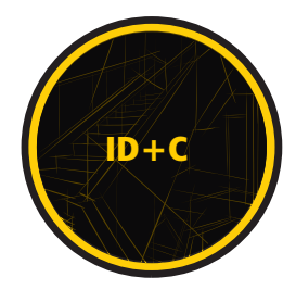
Interior Design and Constructions