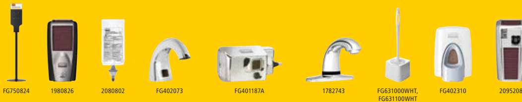
FG750824 1980826 2080802 FG402073 FG401187A 1782743 FG631000WHT, FG631100WHT FG402310 2095208