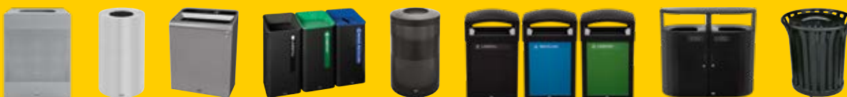
FGSR18SSPL FGAOT35SAPL 1961507 2078988, 2078992, 2078980 FG555ETBKPL 2182672 with 21826721, 21826727, 21826723 2184980 FGMT32PLBK

Waste stream labels for decorative refuse containers are available at specialmade.com/customlabels