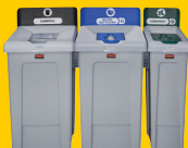
2171554 | 2171557 | 2185051