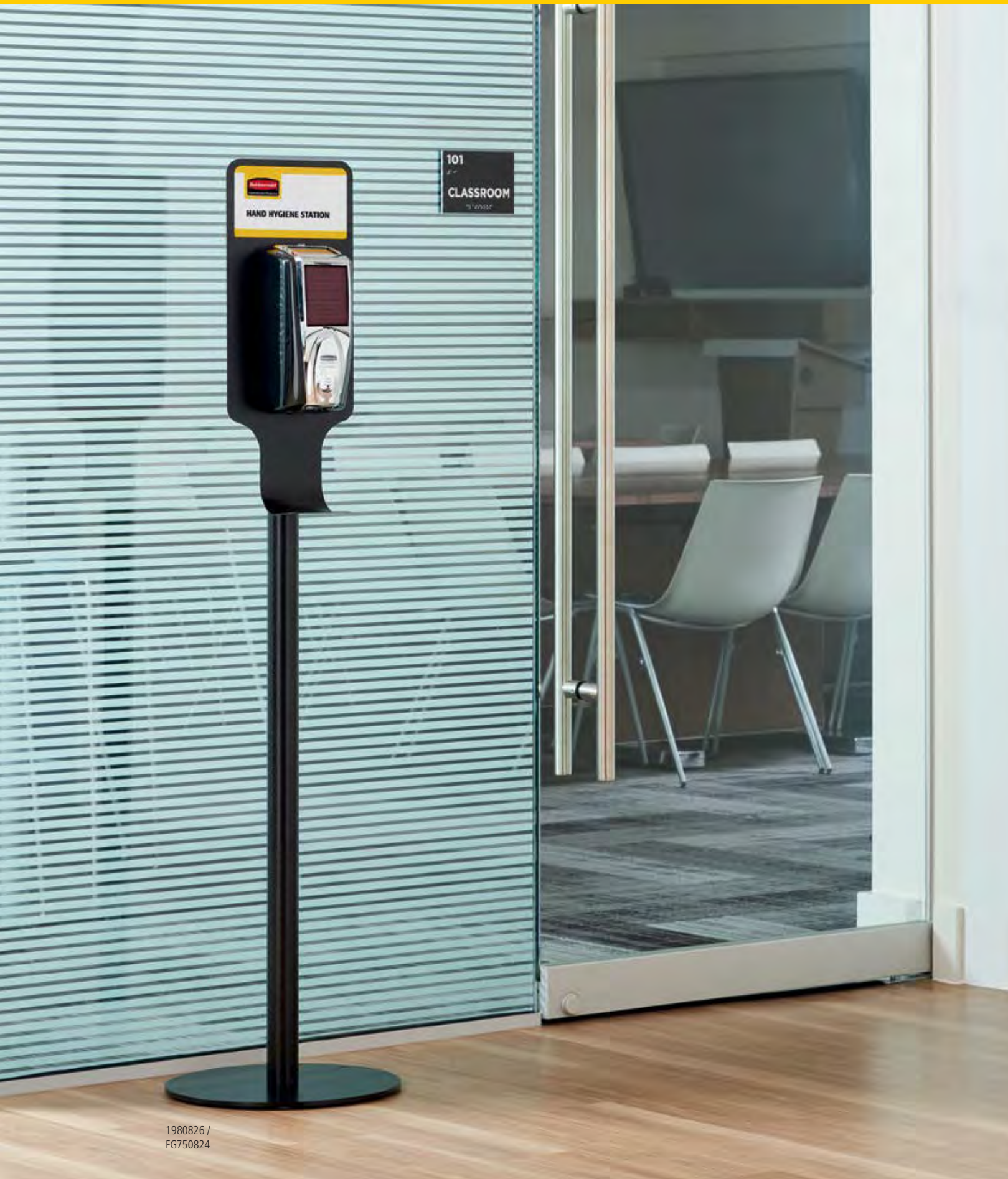
1980826 / FG750824