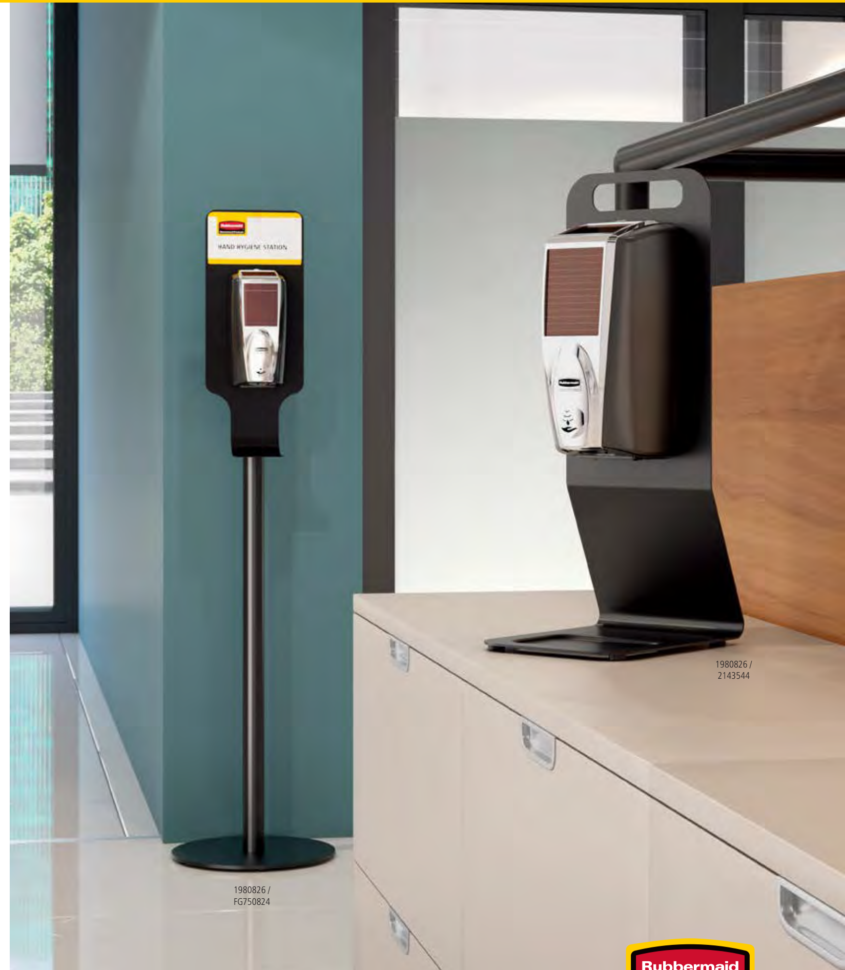
1980826 / FG750824