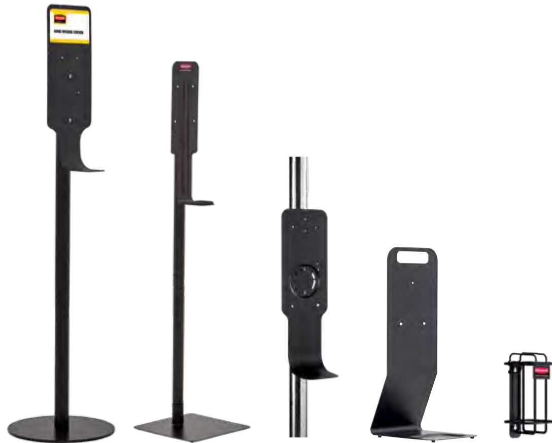
AutoFoam Premium Floor Stand