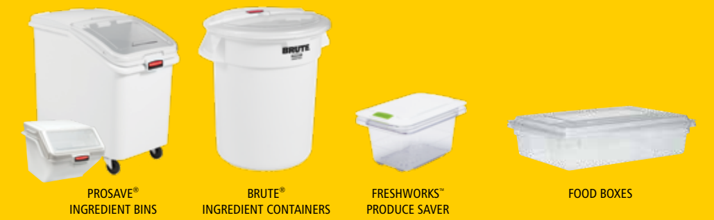
PROSAVE® INGREDIENT BINS BRUTE® INGREDIENT CONTAINERS FRESHWORKS™ PRODUCE SAVER FOOD BOXES

Efficiently store and transport bulk ingredients.