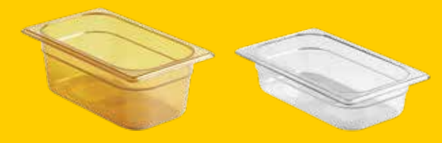
HOT FOOD PANS COLD FOOD PANS

Streamline operations for storing, preparing, cooking, and serving.