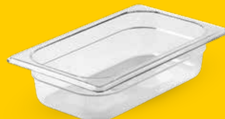
COLD FOOD PAN