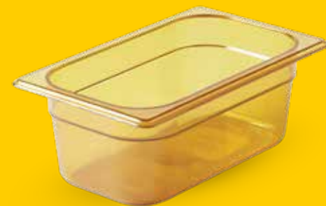
HOT FOOD PAN