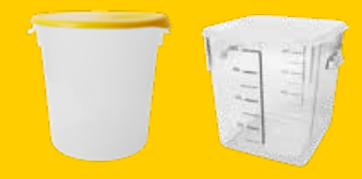
ROUND STORAGE CONTAINERS SPACE SAVING SQUARE CONTAINERS

Store ingredients and prepared food safely.