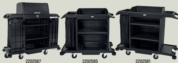
A selection of 3 Carts to choose from: Compact, Full Size & Full Size with Hood & Doors.

With customisable configurations and integrated waste and linen management, they help housekeeping teams stay organised, work efficiently, and deliver exceptional service with every shift.