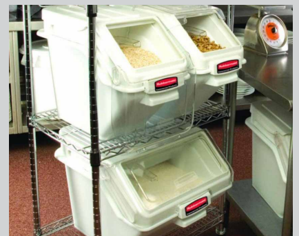
Rubbermaid PROSAVE® Ingredient Bins