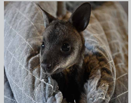
Swamp Wallaby Joey Jenny

"Additionally, their compact size, ability to stack and ease of use has helped ergonomically making food easily accessible, and the clear lids make it easy to identify ingredients."