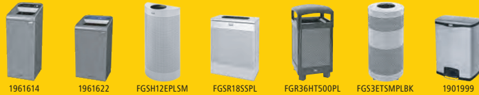
1961614 1961622 FGSH12EPLSM FGSR18SSPL FGR36HT500PL FGS3ETSMLBK 1901999