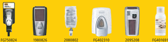
FG750824 1980826 2080802 FG402310 2095208 FG401691