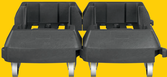
Resin Trainable Dolly