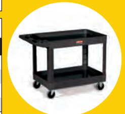
2-SHELF UTILITY CART WITH ERGO HANDLE AND LIPPED SHELF, MEDIUM FG452088BLA