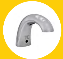
ONE SHOT FOAM DISPENSER FG4870465