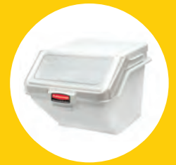
PROSAVE® SHELF INGREDIENT BIN WITH 2C SCOOP FG9G5800WHT