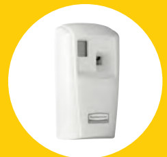
MICROBURST® 3000 DISPENSER 1793532