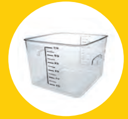
SQUARE STORAGE CONTAINER FG631200CLR