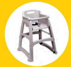
STURDY CHAIR™ YOUTH SEAT WITH WHEELS FG780508PLAT