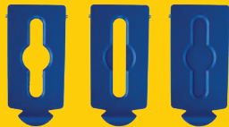
Mixed Recycling Paper Closed