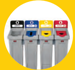
SLIM JIM® RECYCLING STATION