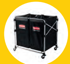
COLLAPSIBLE MULTI-STREAM X-CART 1881781