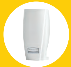
TCELL™ DISPENSER 1793547