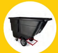
ROTOMOLDED TILT TRUCK FG131400BLA