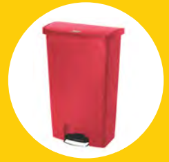
SLIM JIM® STEP-ON CONTAINER 1883568RED