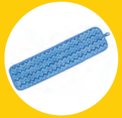
HYGEN™ MICROFIBRE WET PAD FGQ41000BL00