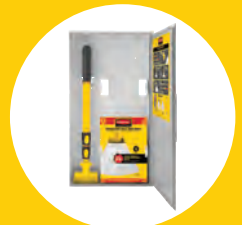
BIOHAZARD SPILL MOP KIT 2031094