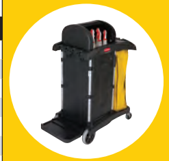
JANITORIAL CLEANING CART - HIGH-SECURITY WITH DOORS AND HOOD FG9T7500BLA