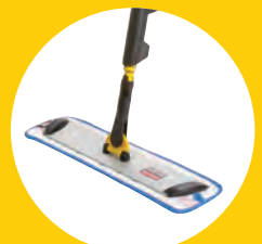
HYGEN™ PULSE™ MICROFIBRE MOP KIT 1835528