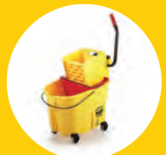
WAVEBRAKE® SIDE-PRESS BUCKET AND WRINGER FG758088YEL