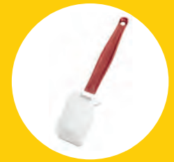
HIGH HEAT SPATULA FG1962000000