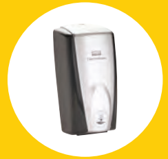
AUTOFOAM TOUCH-FREE DISPENSER FG750411