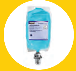
AUTOFOAM REFILL - ENRICHED HAND SOAP WITH MOISTURISERS FG750112