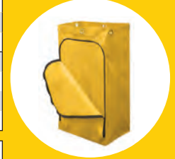
JANITORIAL CLEANING CART VINYL BAG – TRADITIONAL 1966719